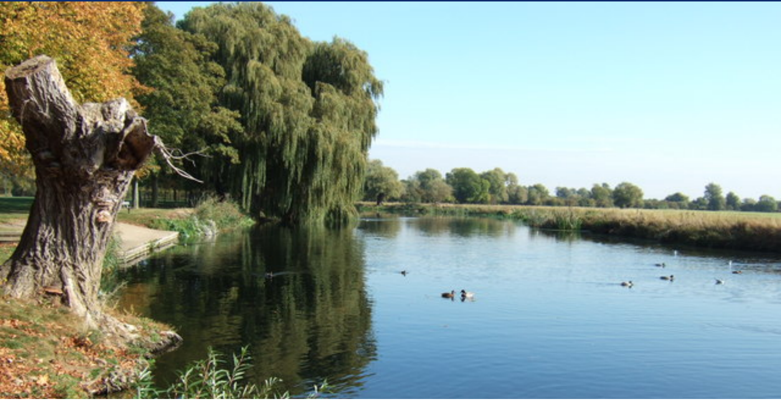
The River Ouse at Huntingdon

On 24 February 2025, Lewes District Council approved the Rights for the River Ouse Charter, making the River Ouse in Sussex the first river in England to be recognised as a living entity with its own intrinsic right to exist.