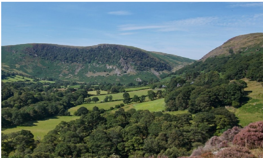
Giflach Nature Reserve

Because the charity works to protect what is left of a wild Britain. It has three main objectives: to allow natural processes to develop; to create space for wildlife and to address the climate crisis. Through extensive work on eighteen nature reserves and collaborative efforts with local landowners and farmers, RWT is driving these objectives forward and creating a wilder, healthier and ecologically richer landscape for all that live there, the bats and otters as well as the people.