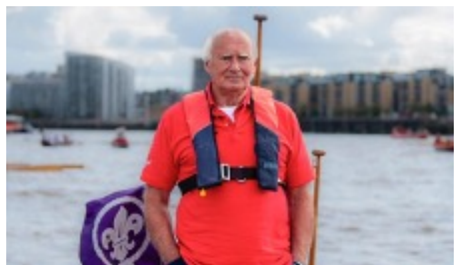
Sandra May Royal Shallop Jubilant