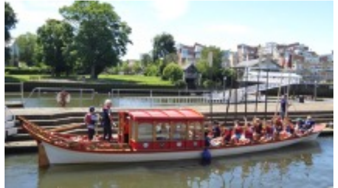
The Royal Shallop Jubilant in action with a group of young people