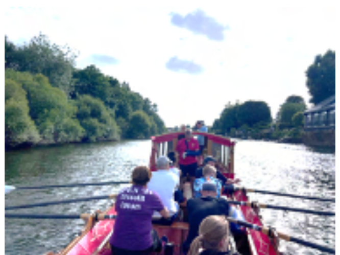
Training for GRR 2024